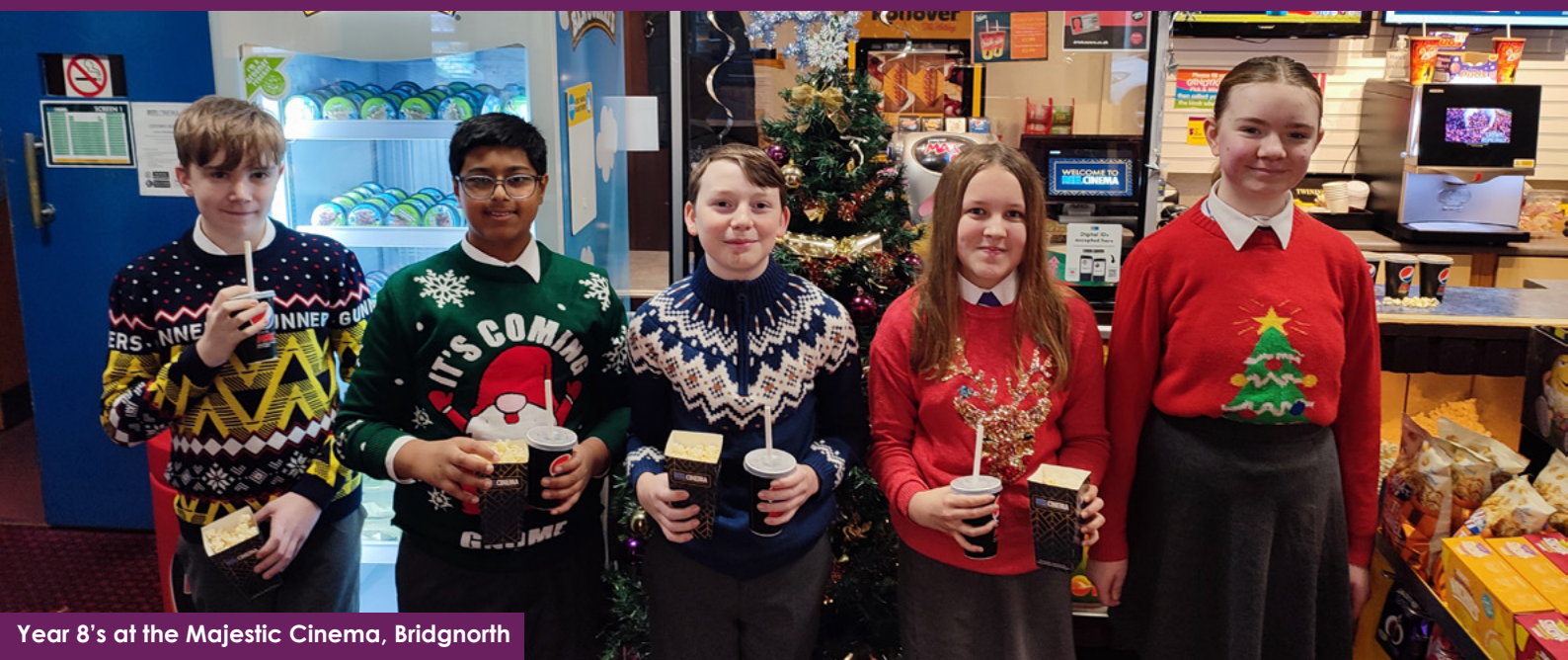
Year 8's at the Majestic Cinema, Bridgnorth